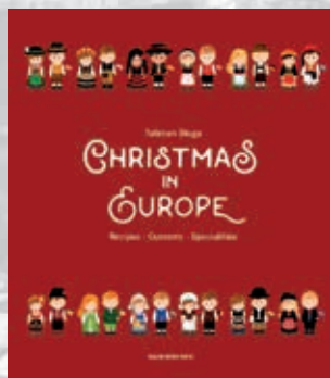
Christmas in Europe ISBN 978-3-7025-0941-5