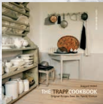
The Trapp Cookbook ISBN 978-3-7025-0676-6