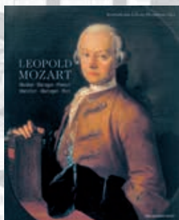
Leopold Mozart ISBN 978-3-7025-0933-0