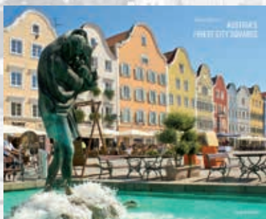
Austria's finest City Squares ISBN 978-3-7025-0800-5